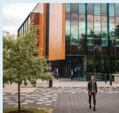
Aerial view of UTM; a student walks through campus