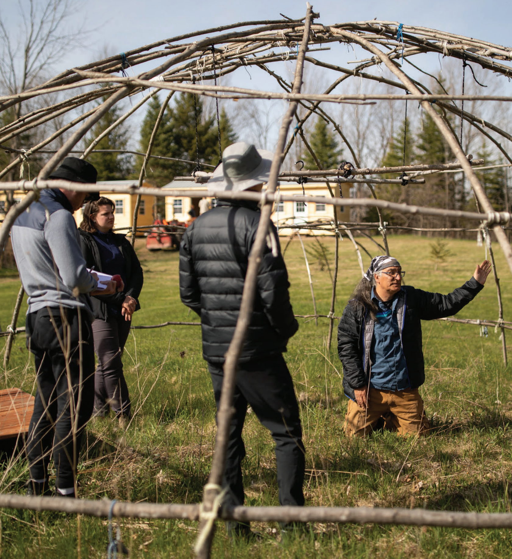
Land-based learning course, Master of Public Health in Indigenous Health (MPH-IH) program