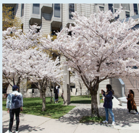
Aerial view of UTSG; cherry blossoms by Robarts Library