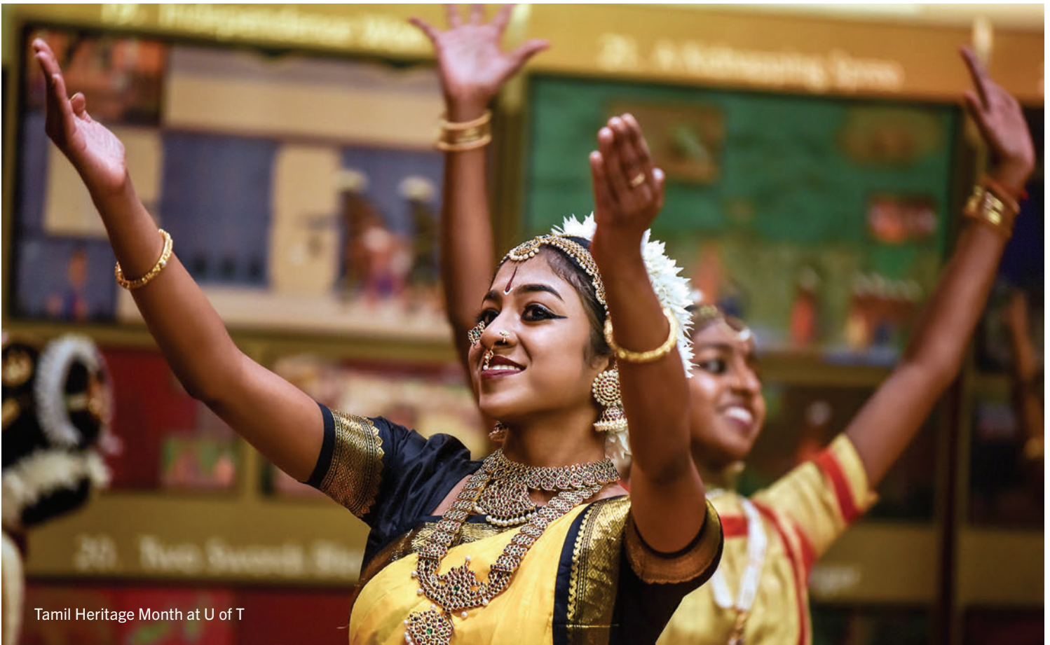
Tamil Heritage Month at U of T