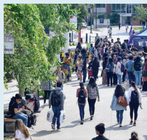
Aerial view of UTSC; UTSC Orientation Week