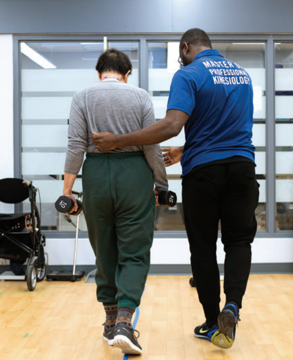
The Master of Professional Kinesiology program offers students a mix of classroom and experiential education

Our Strategic Research Plan highlights the scope of scholarship at U of T and identifies seven interconnected thematic areas that are designed to facilitate excellence and collaboration, and to address issues of local, national, and global importance: