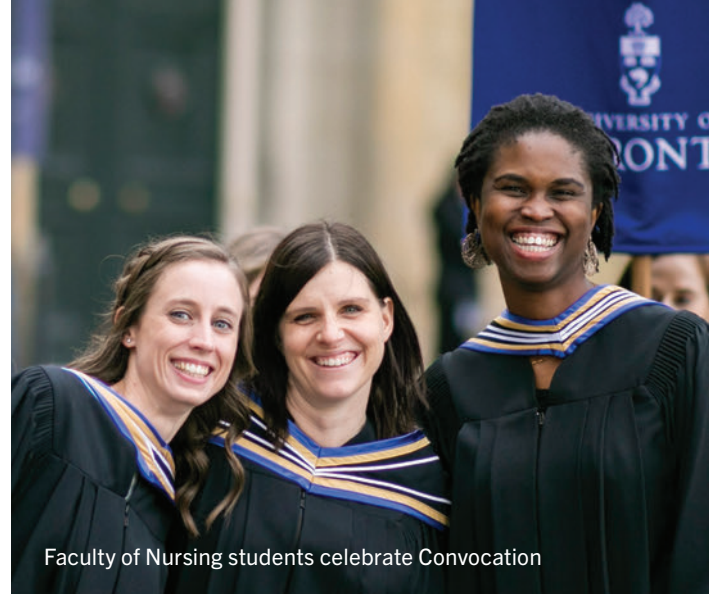
Faculty of Nursing students celebrate Convocation