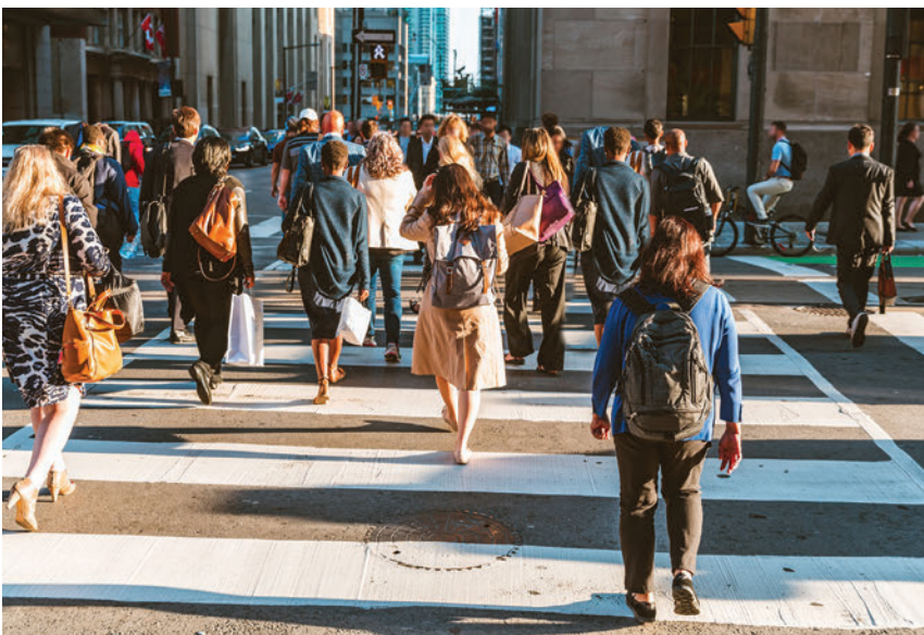
A busy intersection, downtown Toronto